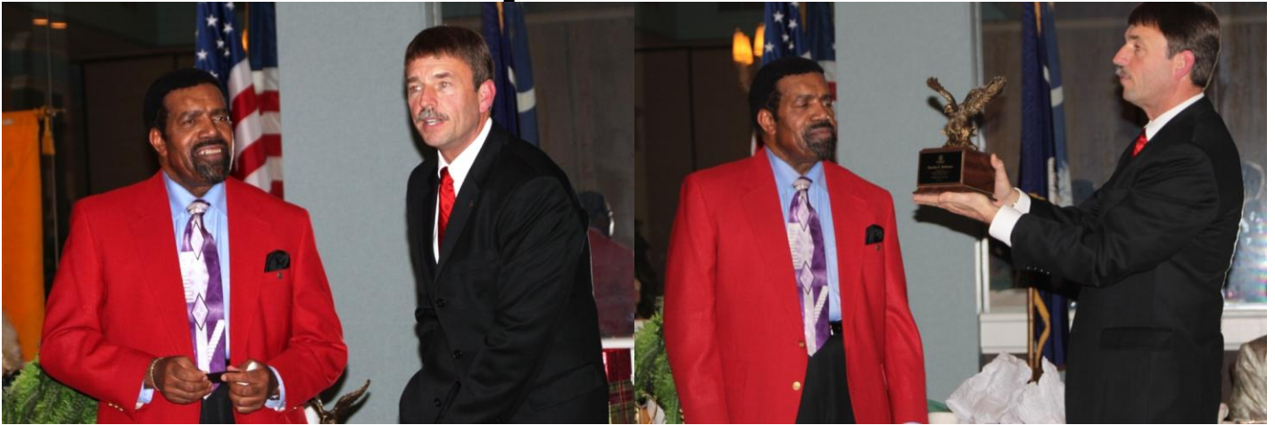
Charles Z. Robinson, SC Governor (2 nd Time) receives prestigious jacket and award.