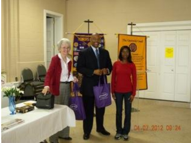
Guest Speaker: RHSD # 3