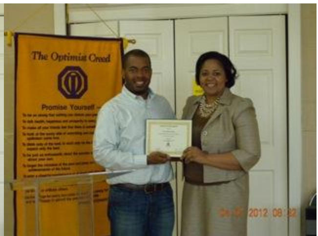
April Club Meeting Recognitions